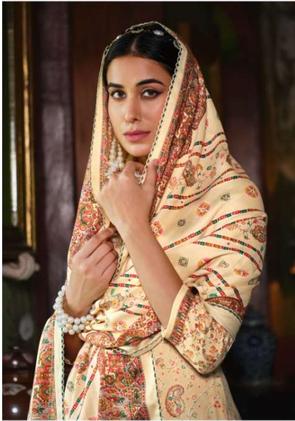
THE WORLDCHARMER | 522-001

EACH THREAD HAS BEEN CHOSEN WITH Meticulous CARE. THE GREATEST PRECISION HAS ENGAGED WHEN CRAFTING A DESIGN WHICH YOU WOULD LOVE UP TO HER BOUNDED. A SILK AND COTTON TO ENHANCE HER BEAUTY.