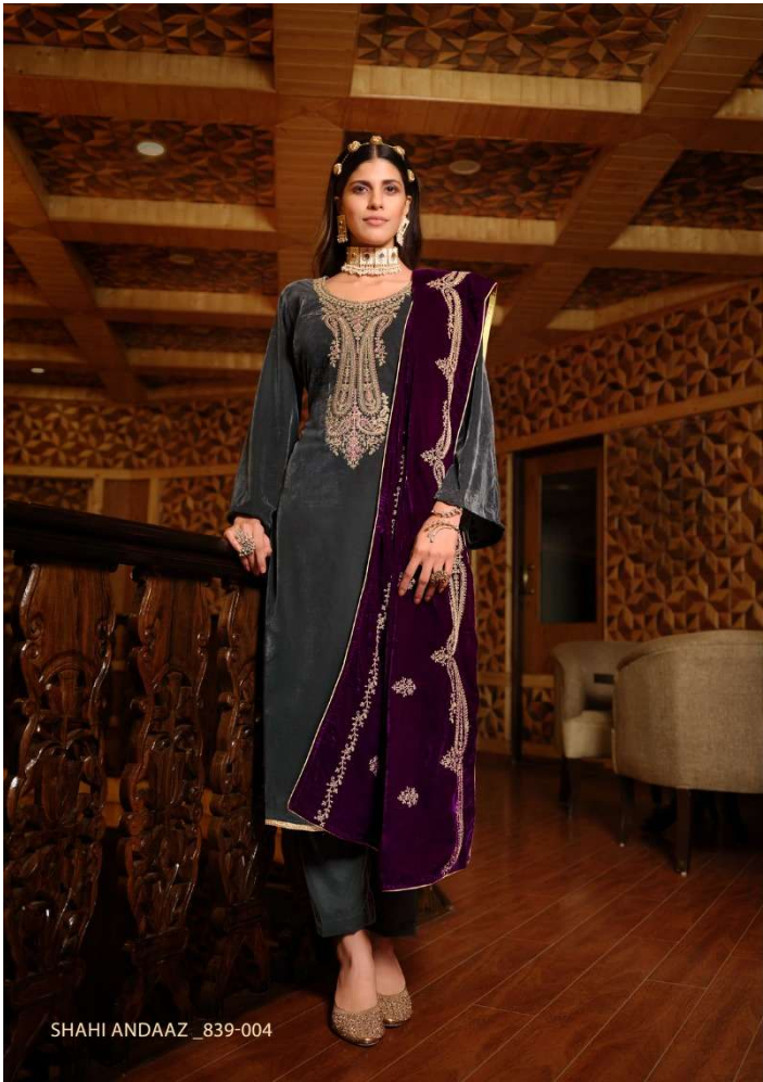
SHAHI ANDAAZ _ 839-004