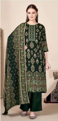
• H-950-005 •