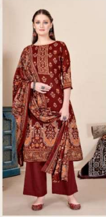
• H-950-002 •