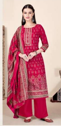
• H-950-004 •