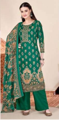
• H-950-001 •