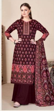
• H-950-003 •