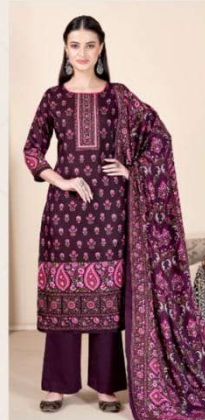
• H-950-008 •