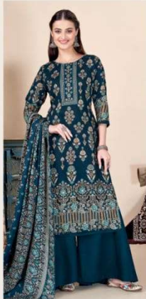
• H-950-006 •