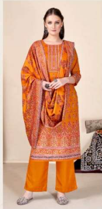
• H-950-007 •