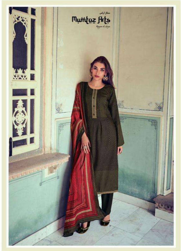
JASMINE | 58005