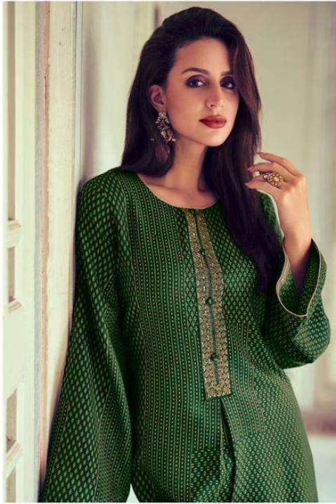
JASMINE | 58001

Classic styles with luxurious soft fabrics are highlighted by REFINED and FEMINE details.