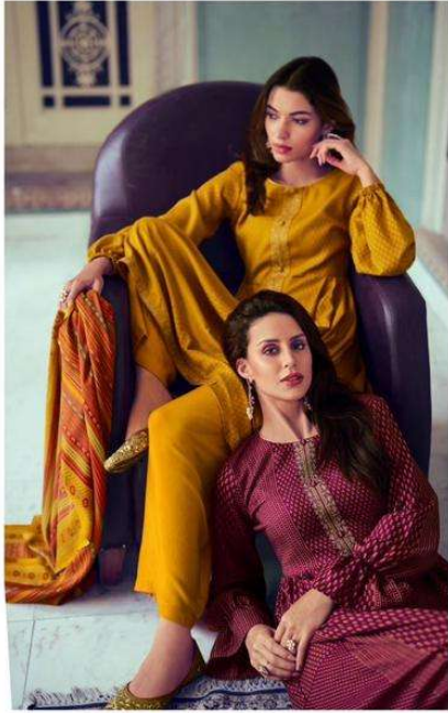
We've HANDPICKED the key pieces that you must get your hands on before they FLY OFF the racks.