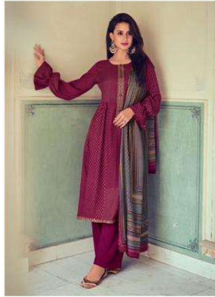
JASMINE | 58004

منتاز آرٹس Muntaz Arts Regen de Regen JASMINE VOL-3