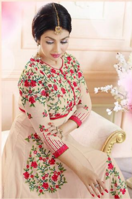
The sparkling glitter of innocence is best exemplified through these designs. Be the queen of virtue you were destined to be.