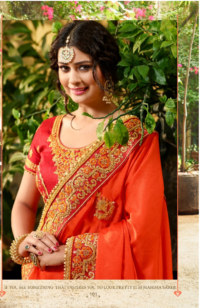
IF YOU SEE SOMETHING THAT INSPIRES YOU TO LOOK PRETTY IT IS MAHIMA SAREE.