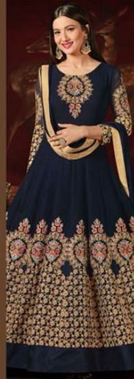
D NO .10005