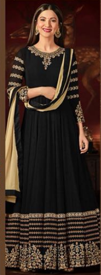
D NO .10006