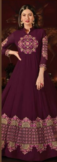
D NO .10002