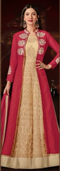
D NO .10001