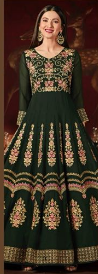
D NO .10003