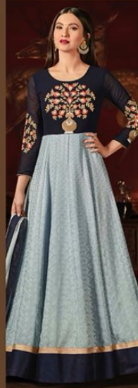
D NO .10004