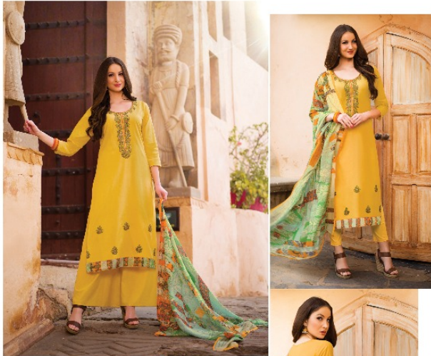
Embroidered Front & Printed Border. Dyed Yellow colour Top and Sleeves, Flora Motif Printed Dupatta & Dyed Bottom.