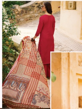
Embroidered Turtl & Dyed Printed Rag colour Top and Sleeves, Classic Retro Printed Dupatta & Dyed Bottom.