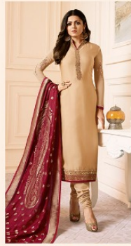
• D.NO.2008 •