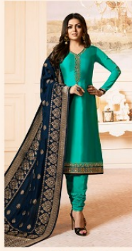
• D.NO.2001 •