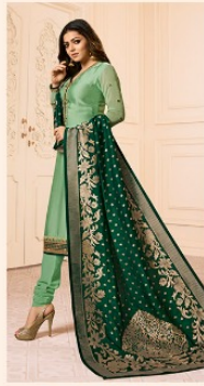
• D.NO.2003 •