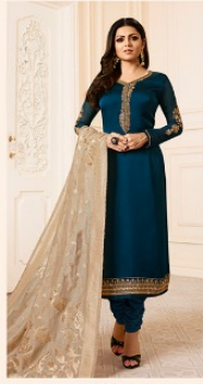
• D.NO.2005 •