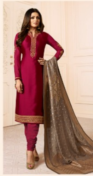
• D.NO.2007 •