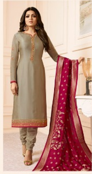
• D.NO.2002 •