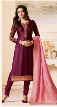
• D.NO.2004 •