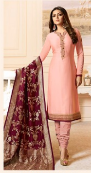
• D.NO.2006 •