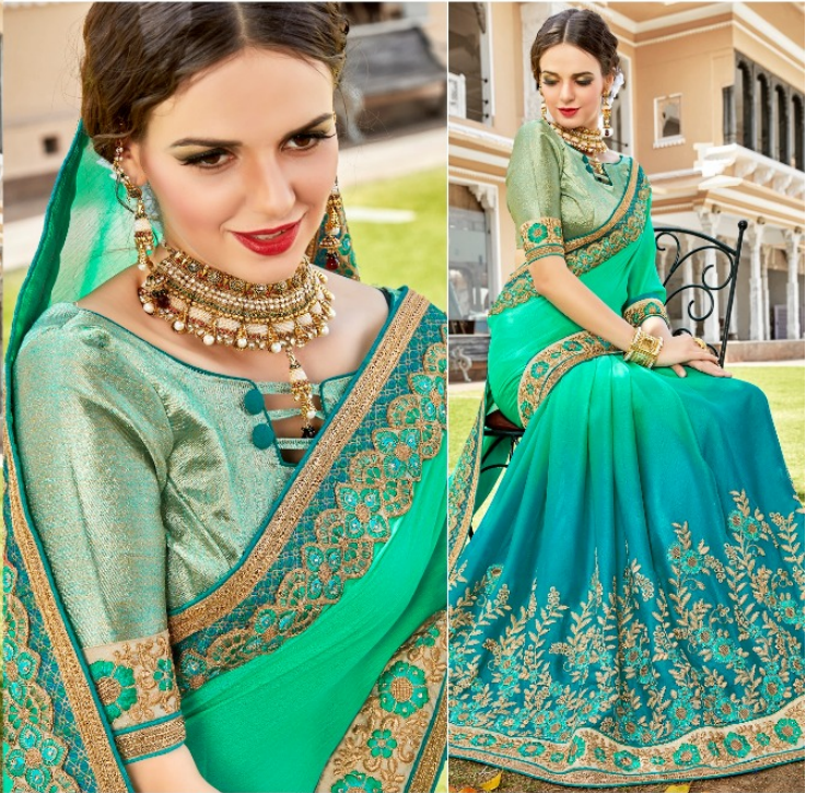
FLICKER OF PRIDE 2401