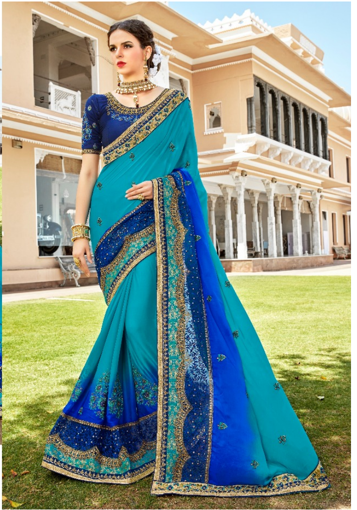
GLITTERING Beauty 2404