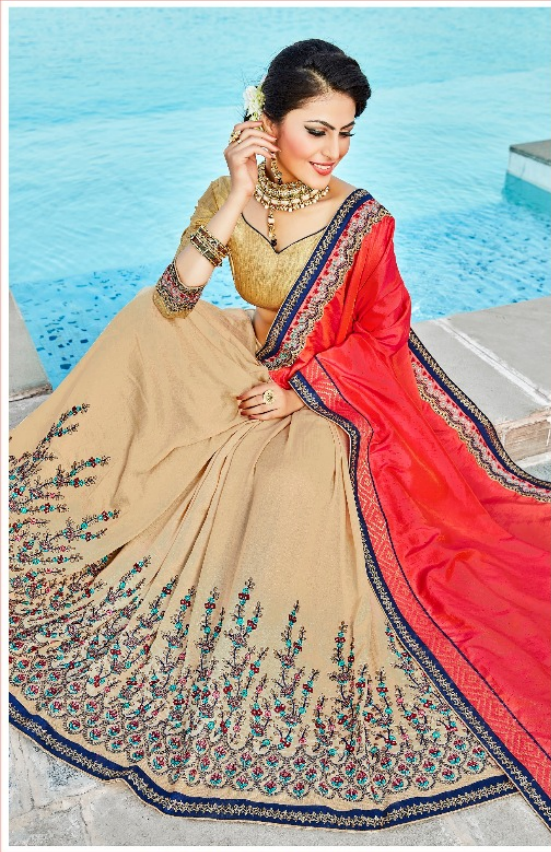
BEAUTY OF ETERNAL 2403