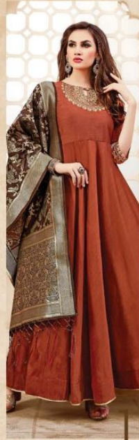
[ 4010 ]