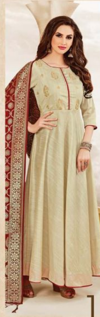
[ 4012 ]