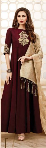
[ 4007 ]