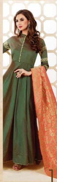
[ 4011 ]