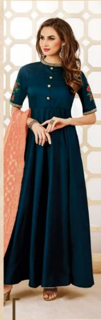
[ 4009 ]