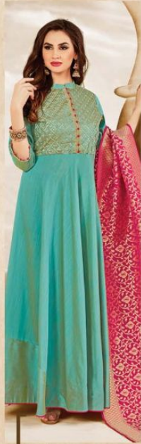
[ 4008 ]