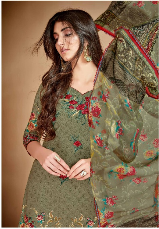
It is the caring that she lovingly gives the passion that she shows The beauty of a woman grows with the passing years. # CODE _6002