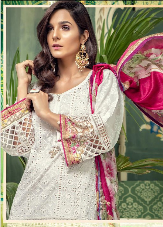
MARIYA.B.LAWN 18 Eid Collection