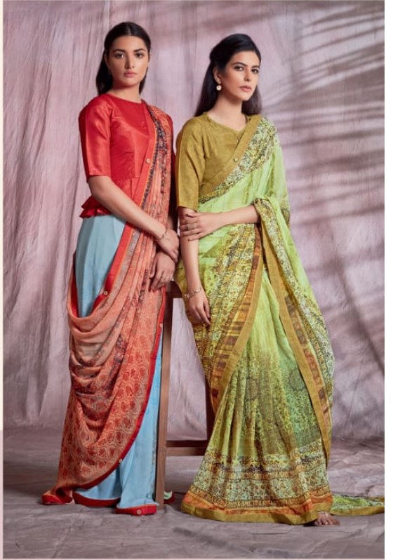
PC-41210 (left) and PC-41211 (right)