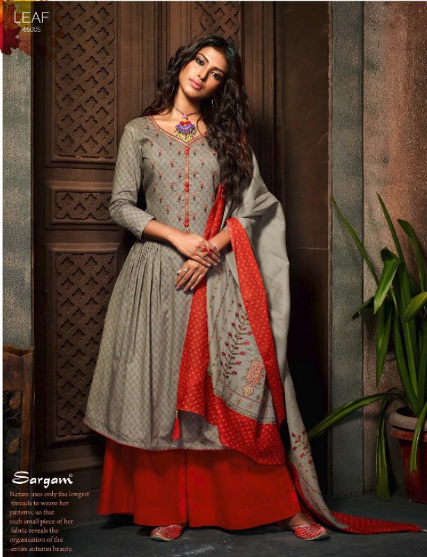
Sargani Nature uses only the longest threads to weave her patterns, so that each small piece of her fabric reveals the organization of the entire autumn beauty.