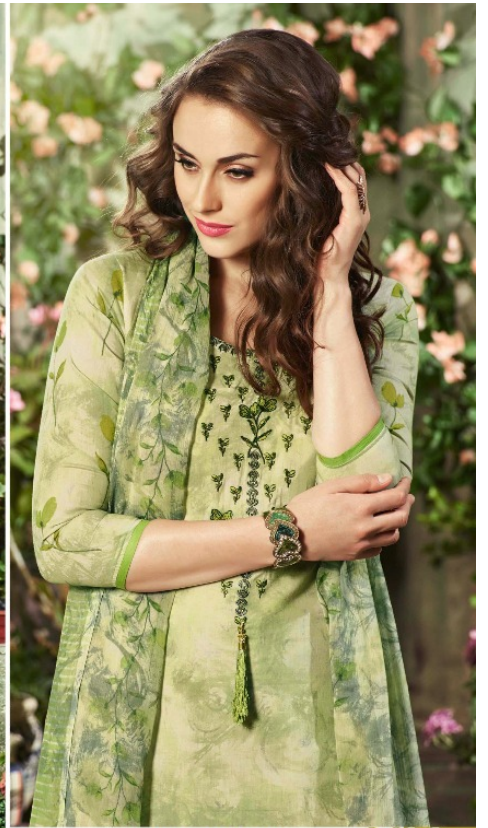
ART STOCKS D.58006 A