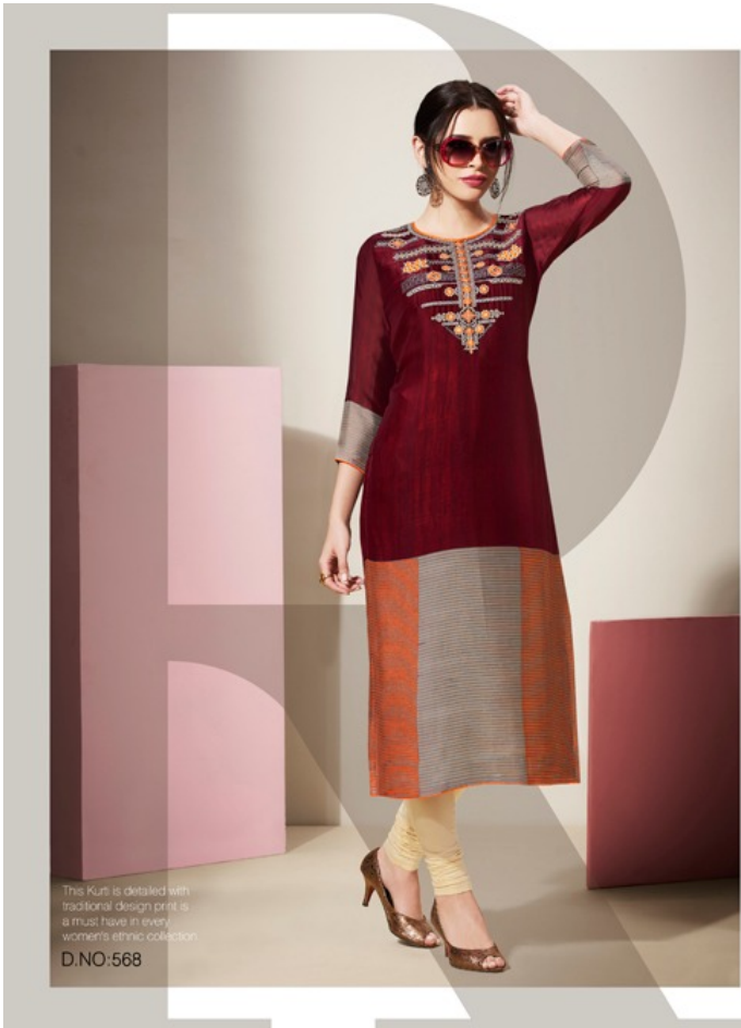
This Kurti is detailed with traditional design print is a must have in every women's ethnic collection. D.NO.568