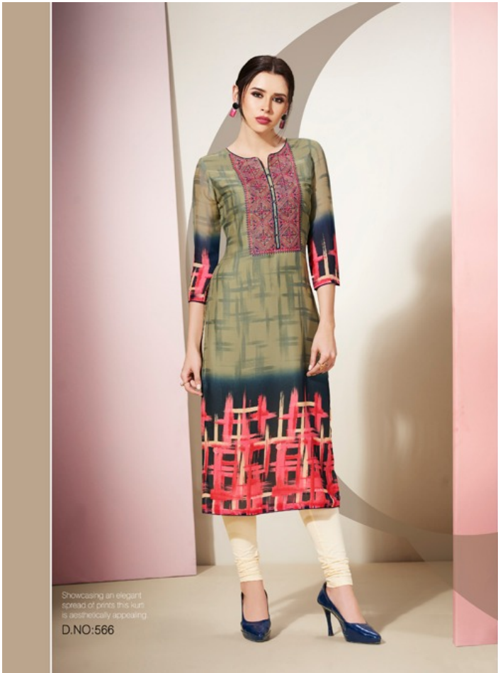
Showcasing an elegant spread of prints this kurta is aesthetically appealing. D.NO:566