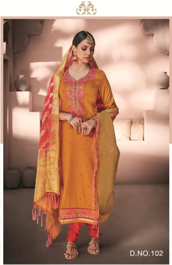
The essence of beauty and elegance wrapped altogether.