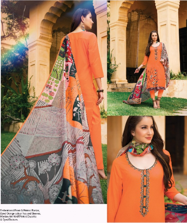
Embroidered Front & Printed Backing, Dyed Orange color, 100% and Sleeves, Moran Art Motif Printed Dussote & Dyed Backing.