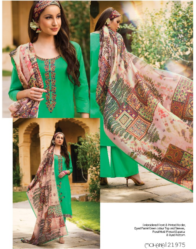
Embroidered Front & Printed Border, Dyed Pastel Green colour Top and Sleeves, Floral Motif Printed Dupatta & Dyed Bottom.