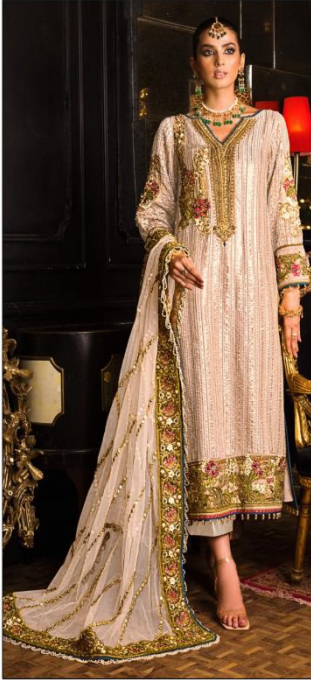
S - 115 D