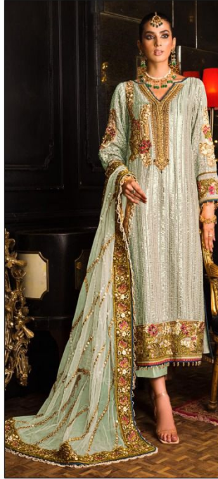
S - 115 F