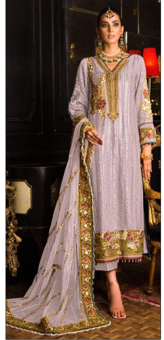
S - 115 G