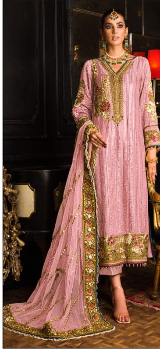
S - 115 E