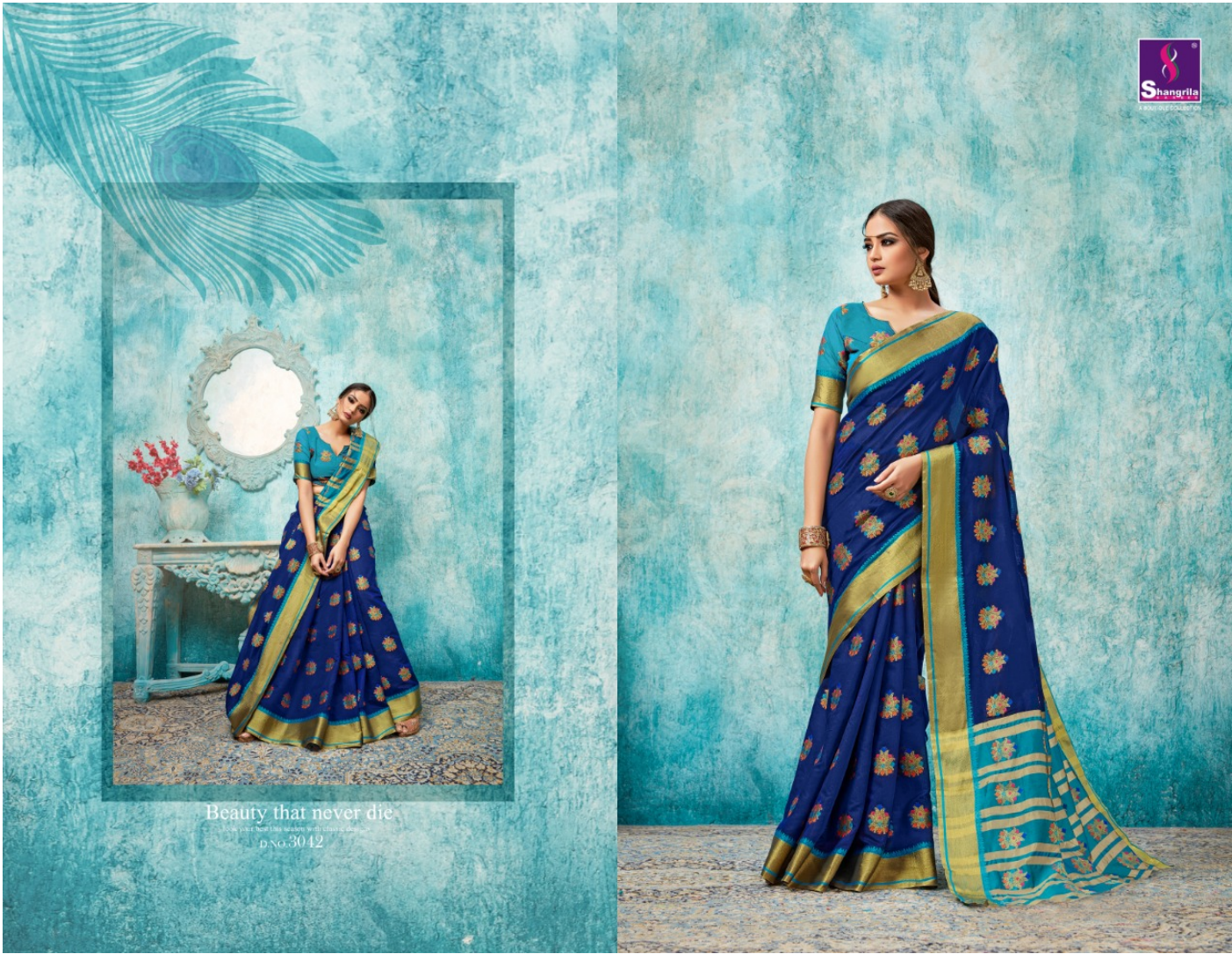
Beauty that never die D.No.30/2