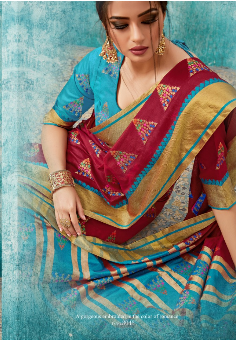
A gorgeous embroidered in the color of romance n.No.3043