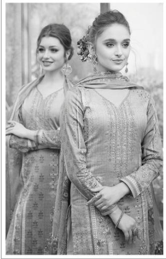
Complimentary copy not for sale