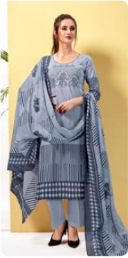
Style # 2003