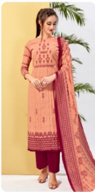
Style # 2008