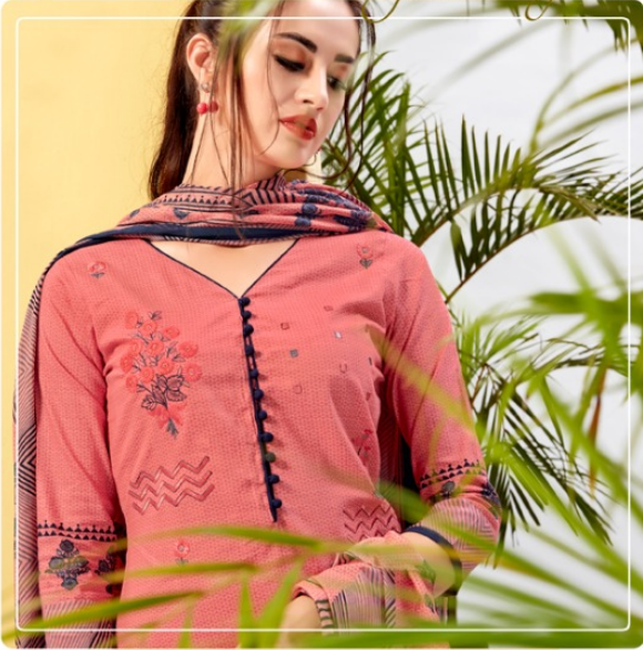
Style # 2002

Being Classy Nurturing wheremy in your life with our graceful collection of attire.