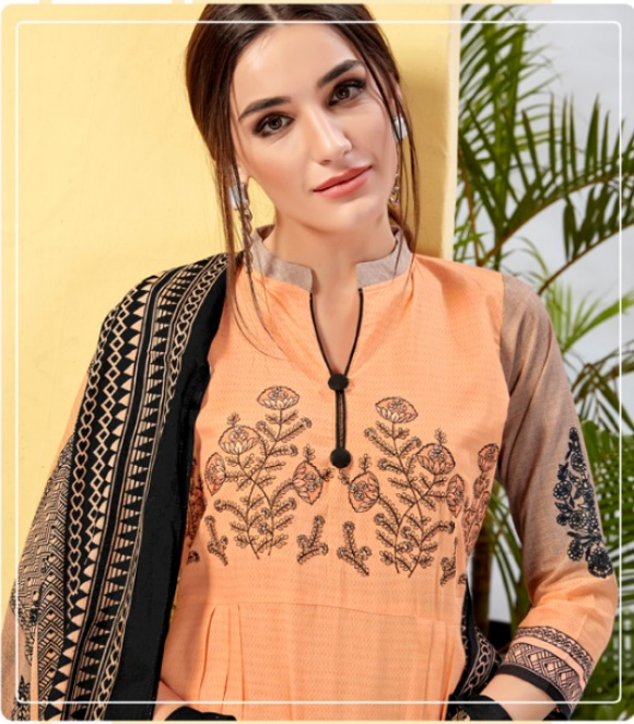
Style # 2005

True beauty is being confidence & proud of yourself. No matter how many people may disagree.