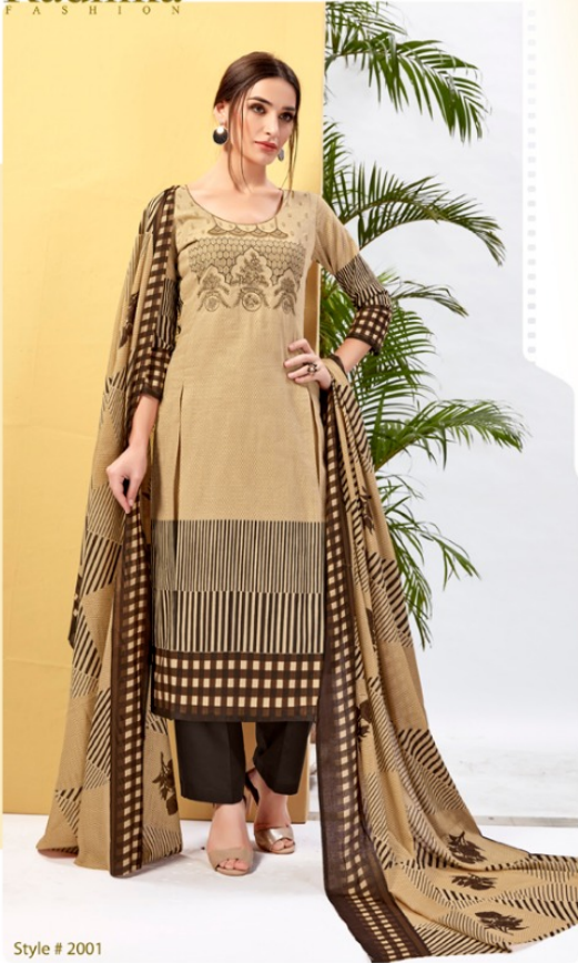
Style # 2001