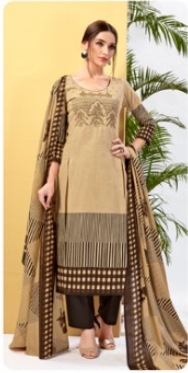
Style # 2001