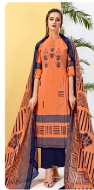
Style # 2010