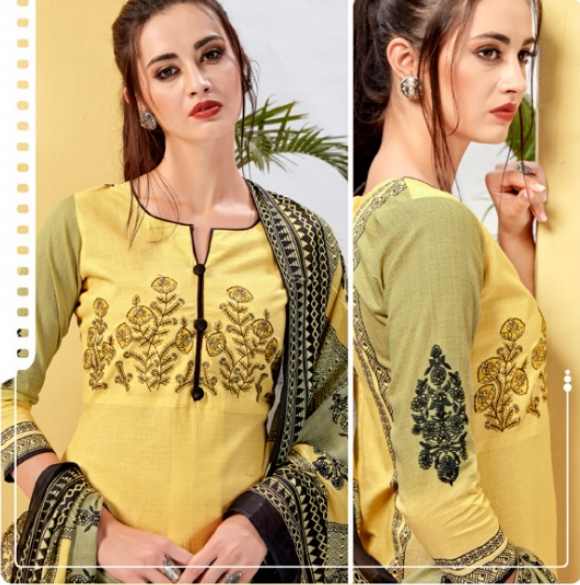
Style # 2006

Women of dream Unfolding the mysteries of beauty, captured in element