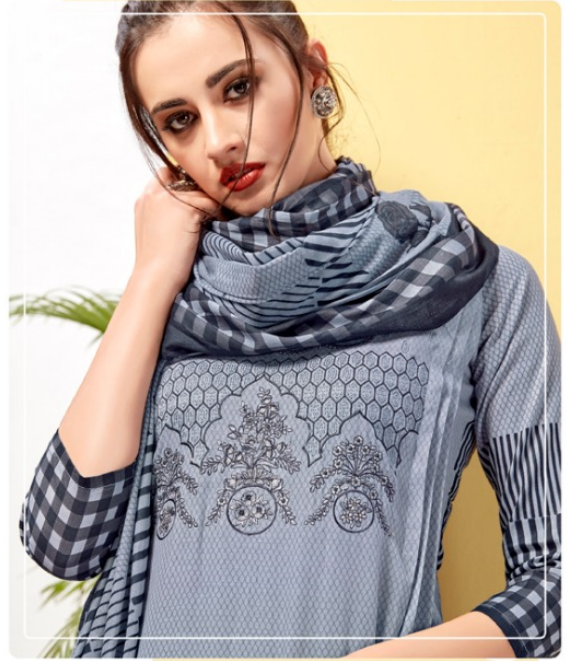
Style # 2003

Fashion is very important. It is life-enhancing and, like everything that gives pleasure, it is worth doing well.