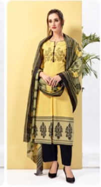
Style # 2006