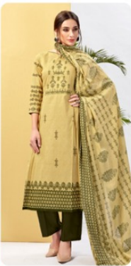
Style # 2009