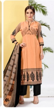
Style # 2005