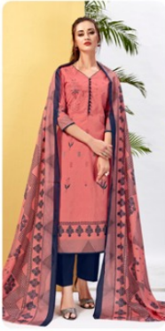
Style # 2002