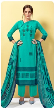
Style # 2007