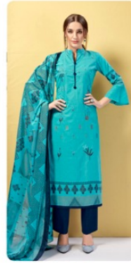
Style # 2004