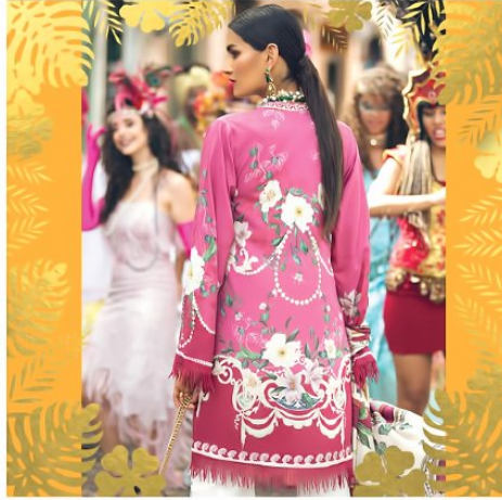
Moving to the rhythm of the drum beats that musicians play.