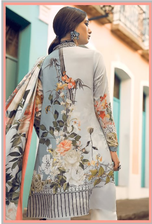
SAADIA ASAD FESTIVAL COLLECTION Vol-02