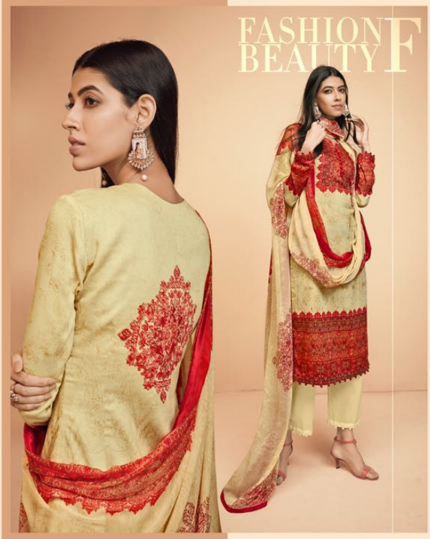
STYLE NO. 06