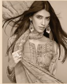
Rule the kingdom of beauty with our range of artistic and sensual collection