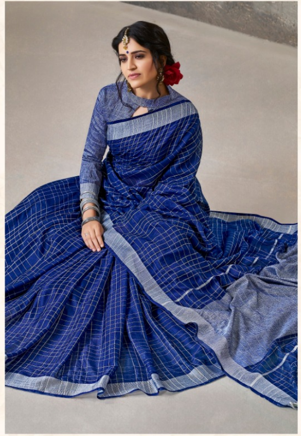
THE ROYAL SAREE D.NO.1005