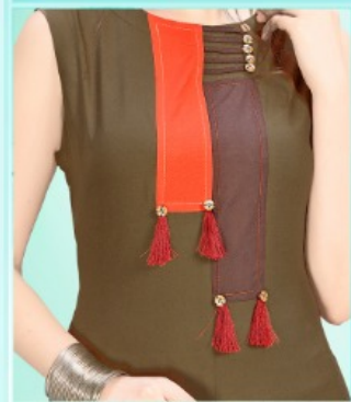
ATTRACTION FOR YOUR STYLE

Our designers tend to give reign to their imagination and create clothes that look interesting and are guided by the desire to attract attention. Off whiteresham, zari, stone and cut border work faux georgette saree.