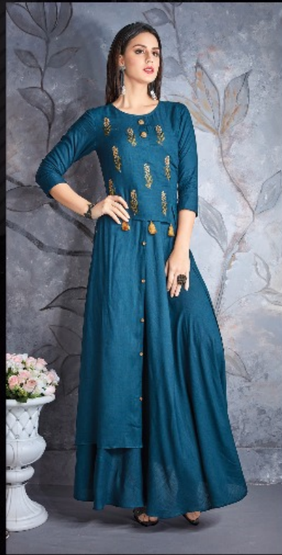
Design Code- 354