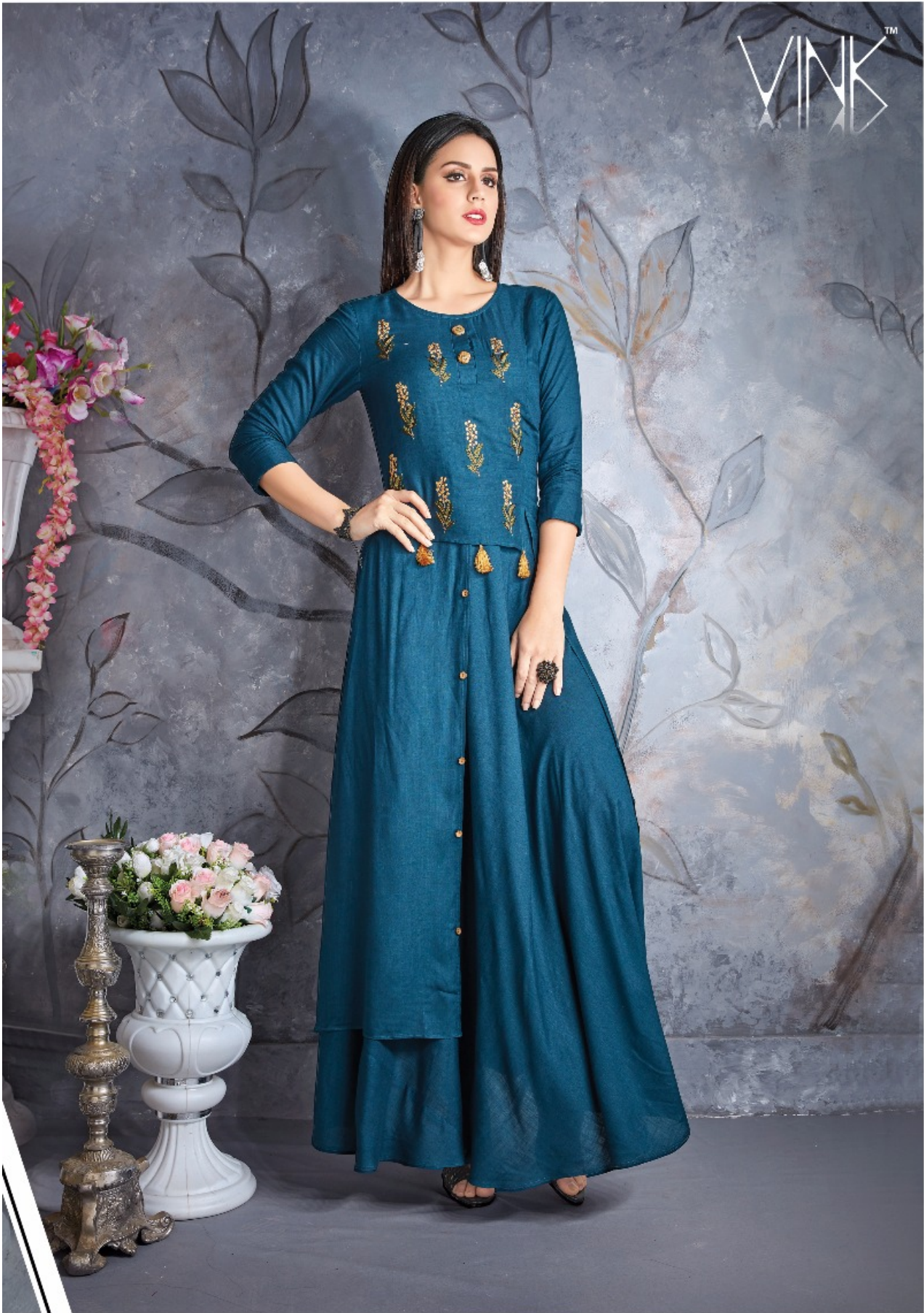
Design Code- 354