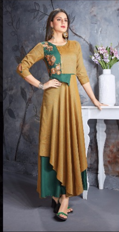
Design Code- 358