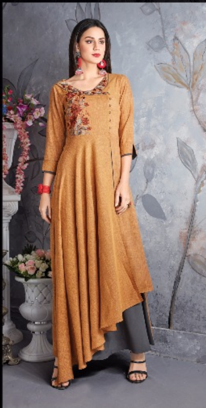
Design Code- 353