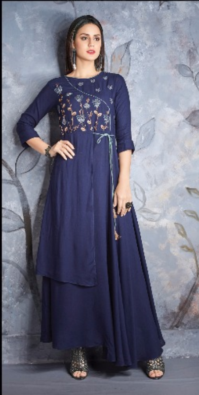
Design Code- 357