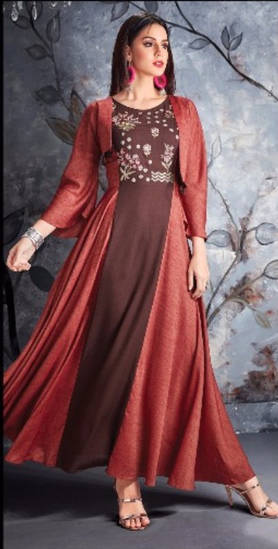
Design Code- 351