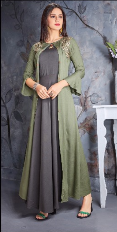
Design Code- 355