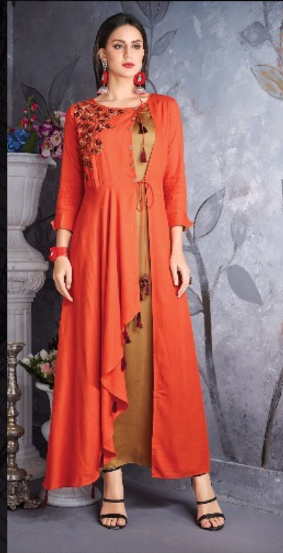
Design Code- 356