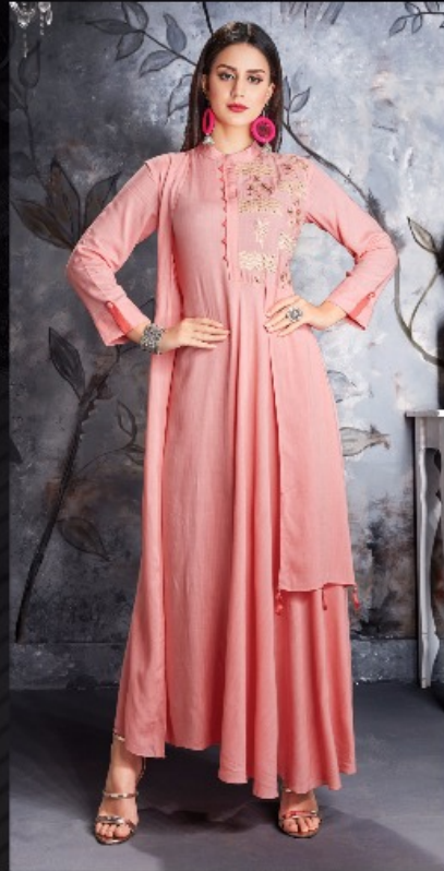
Design Code- 352