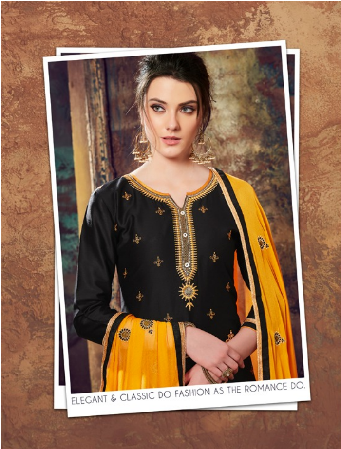
ELEGANT & CLASSIC DO FASHION AS THE ROMANCE DO.