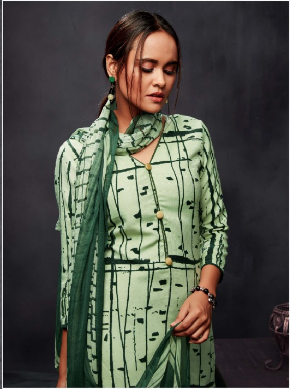
Now's the time to be a little more adventures in prints and colours of your dress experience the exotic floral look and attitude.