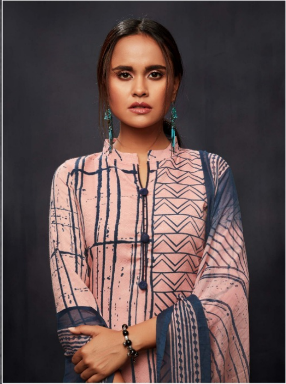
Now's the time to be a little more adventures in prints and colours of your dress experience the exotic floral look and attitude.