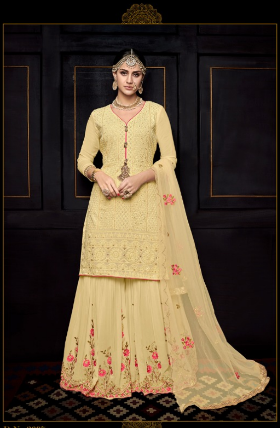
Define elegance in your own style with the purest and best fabric