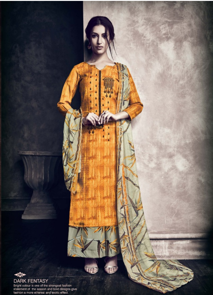
DARK FANTASY Bright colour is one of the strongest fashion statement of the season and bold designs give fashion a more ethereal and exotic effect.