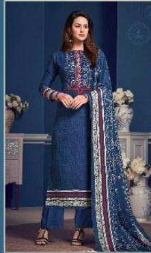
D. No. 1004