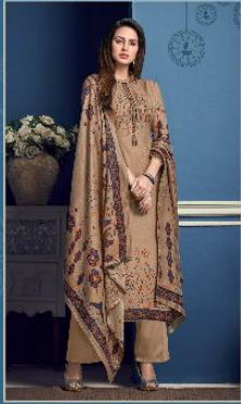
D. No. 1001