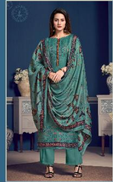
D. No. 1008