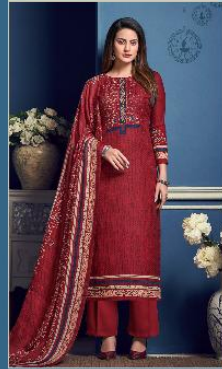
D. No. 1007