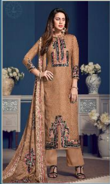
D. No. 1003