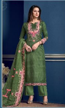
D. No. 1002