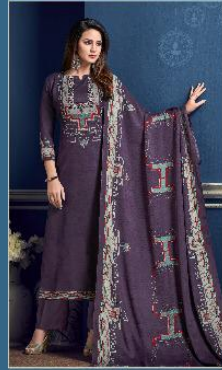
D. No. 1005