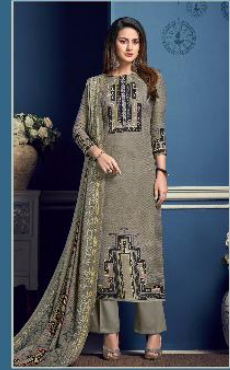
D. No. 1006