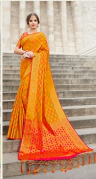
STYLE | 5136