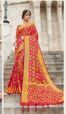
STYLE | 5142