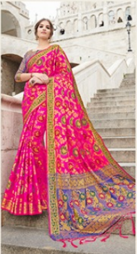
STYLE | 5134