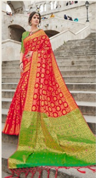
STYLE | 5135