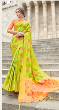
STYLE | 5140