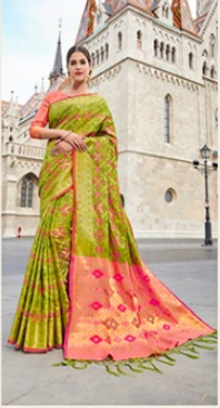
STYLE | 5131