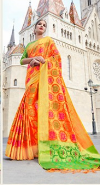
STYLE | 5133