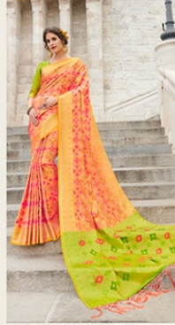
STYLE | 5137