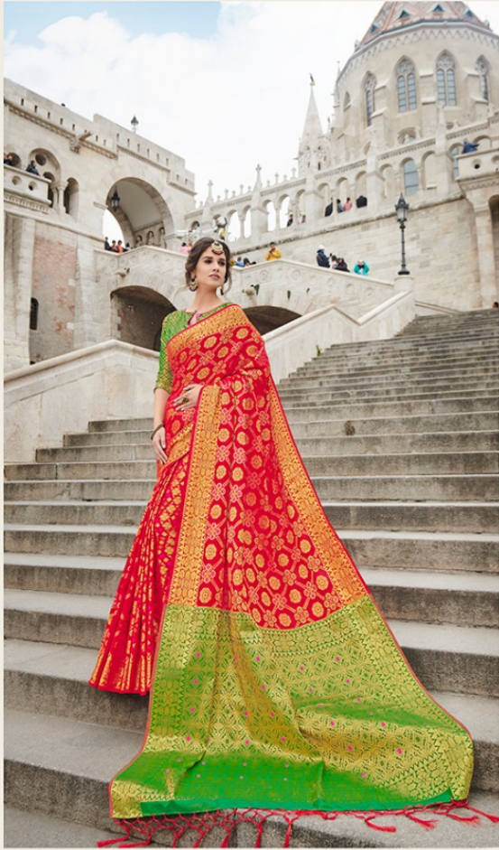
STYLE | 5135