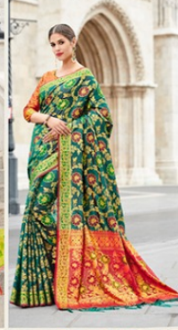
STYLE | 5138