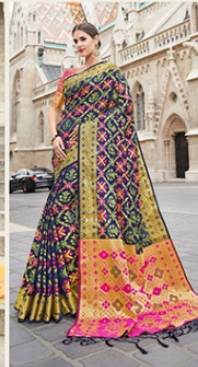
STYLE | 5141