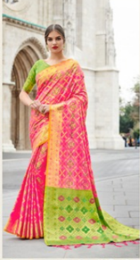
STYLE | 5132