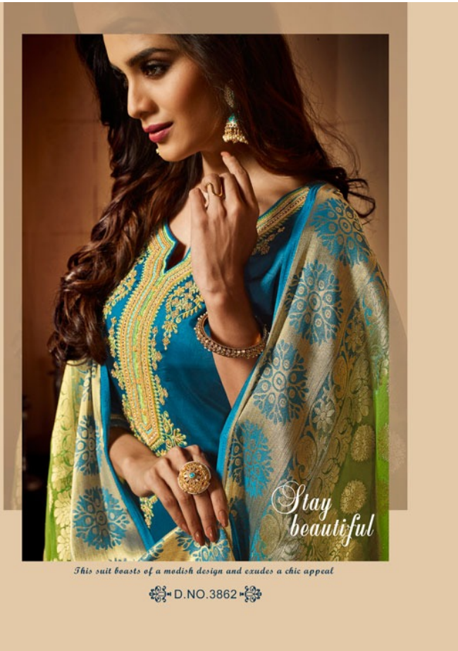
This suit boasts of a modish design and exudes a chic appeal