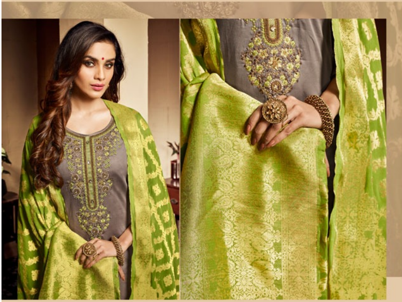
Exclusively designed; this traditional suit will enhance your polished look in no time.