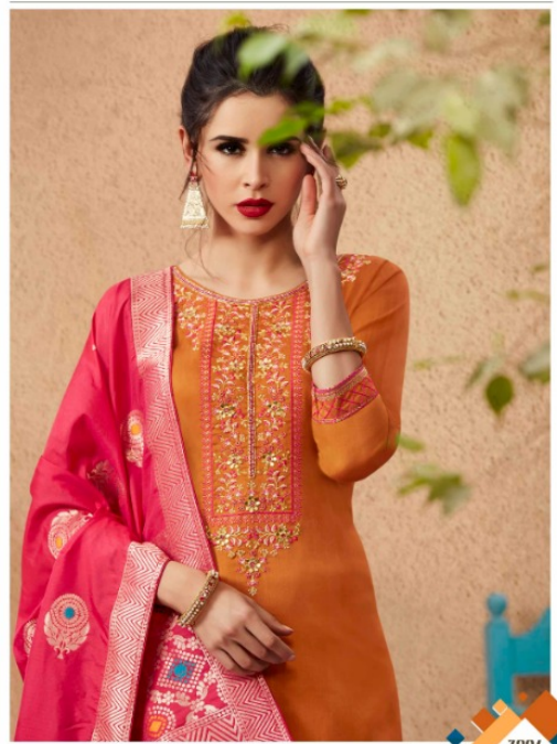
Embrace elegance with class while you adorn this embroidered dress with dupatta that complements dress beautifully.