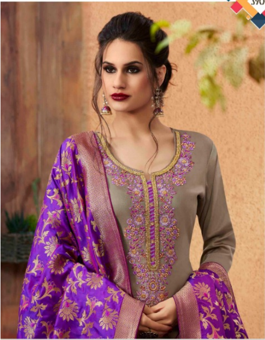
Matchless style, amazing work details and a dash of tradition; what else you need to flaunt on this festive season?