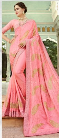
DESIGN NO. 54006