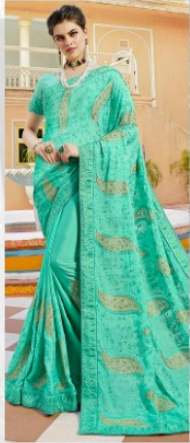
DESIGN NO. 54002