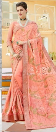
DESIGN NO. 54003