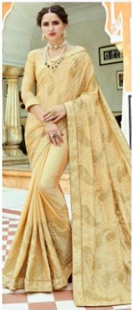
DESIGN NO. 54004