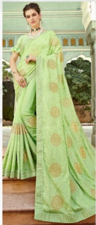
DESIGN NO. 54005