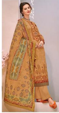
NAITRA | 106