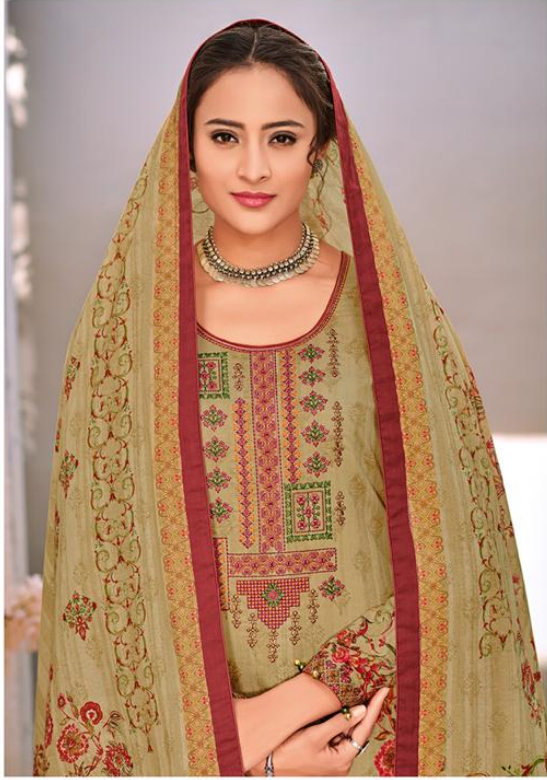
NAITRA | 104