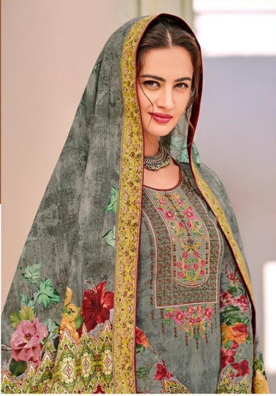
NAITRA | 105