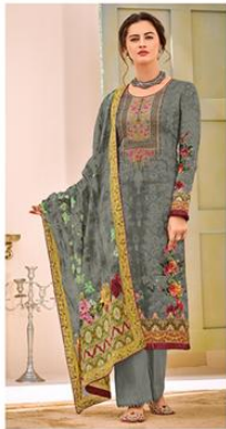
NAITRA | 105

ماہون لائن HOUSE OF LAWN® DEFINING FEMININITY AND LUXURY