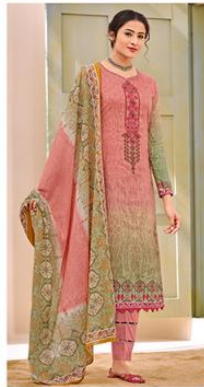
NAITRA | 110