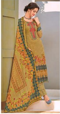
NAITRA | 102