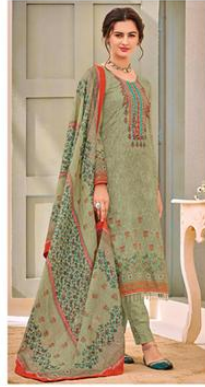
NAITRA | 107