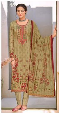
NAITRA | 104