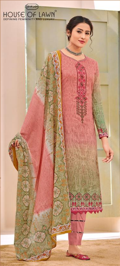
NAITRA | 110

HOUSE OF LAWN ® DEFINING FEMININITY AND LUXURY