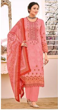
NAITRA | 103