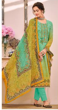
NAITRA | 108