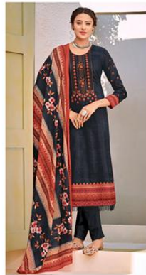
NAITRA | 109

ماہون لائن HOUSE OF LAWN® DEFINING FEMININITY AND LUXURY