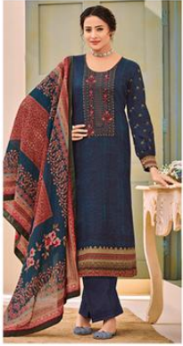
NAITRA | 101