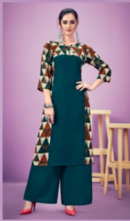
d.no : 1003