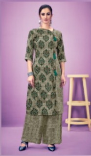
d.no : 1001