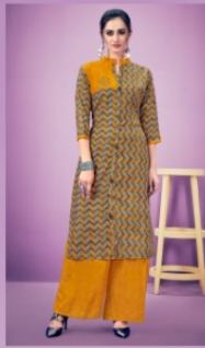
d.no : 1002