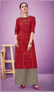
d.no : 1004