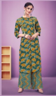
d.no : 1005