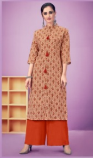
d.no : 1006