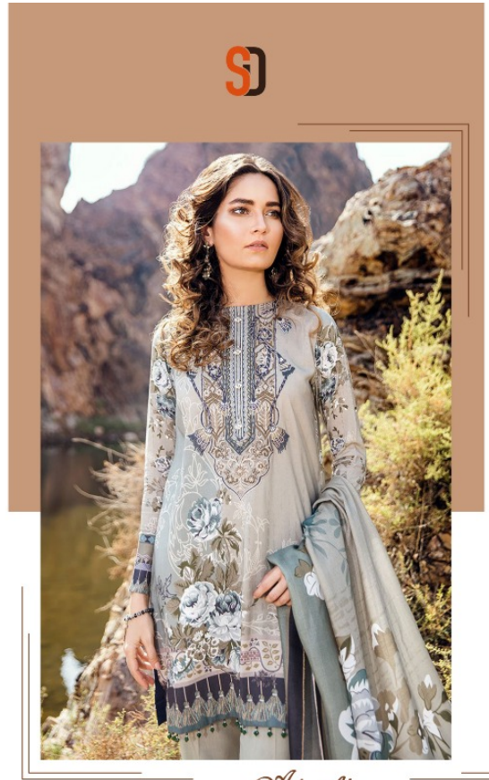
Adorable AMAZ 1001