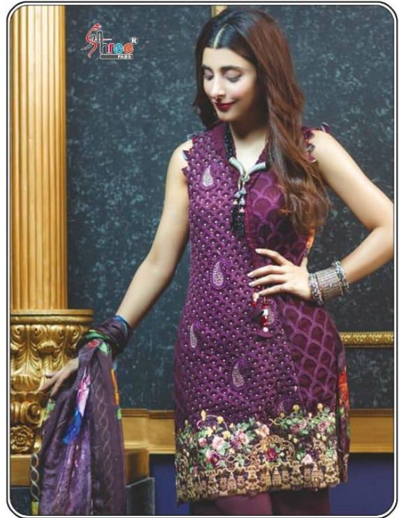
RANG RASIYA Premium Collection