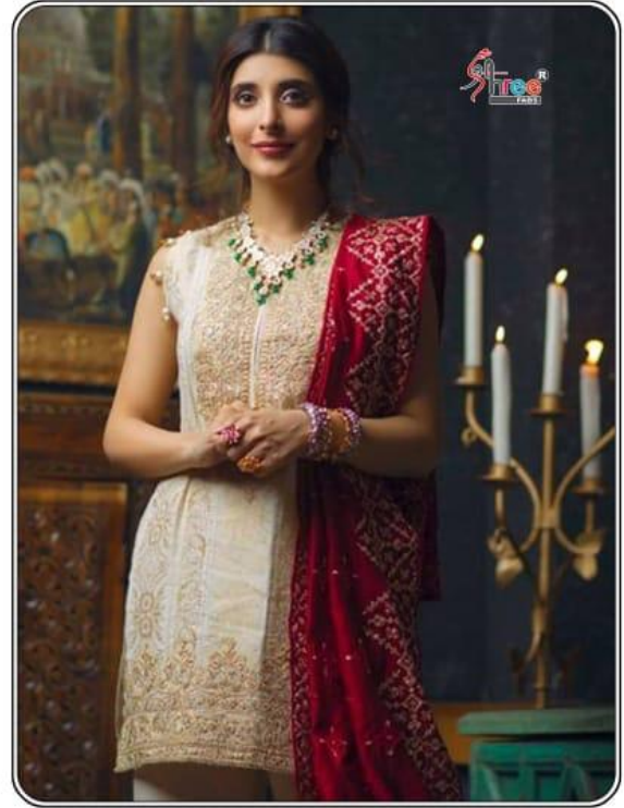
RANG RASIYA Premium Collection