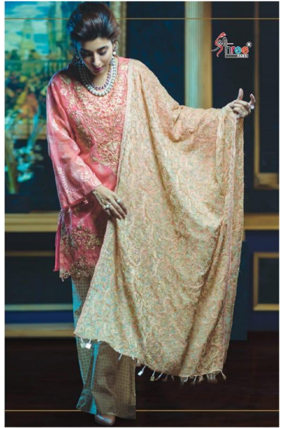
RANG RASIYA Premium Collection