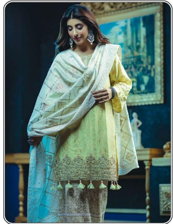
RANG RASIYA Premium Collection