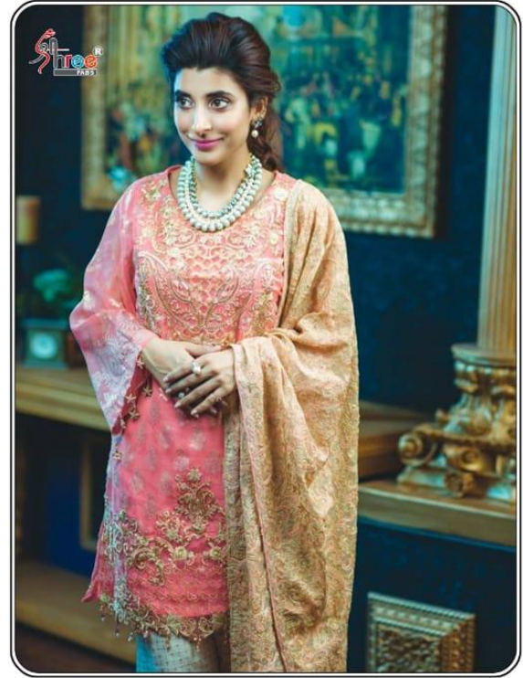
RANG RASIYA Premium Collection