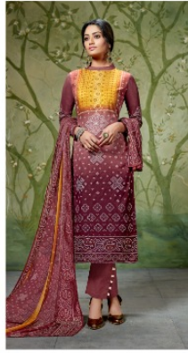
CODE # 1002