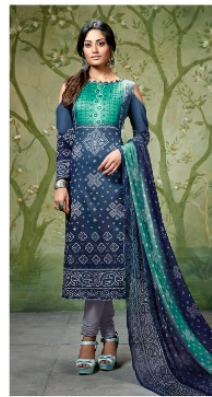
CODE # 1007