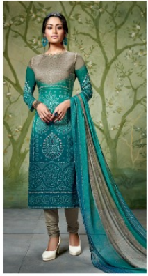
CODE # 1001