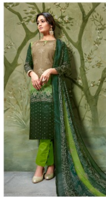
CODE # 1006