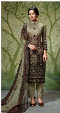
CODE # 1005