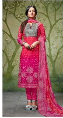
CODE # 1003