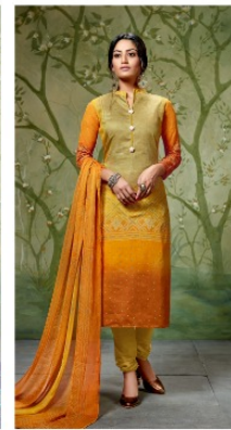
CODE # 1008