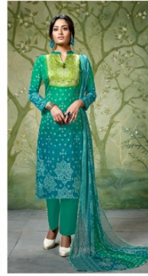
CODE # 1004