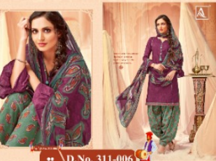
# D.No. 311-006