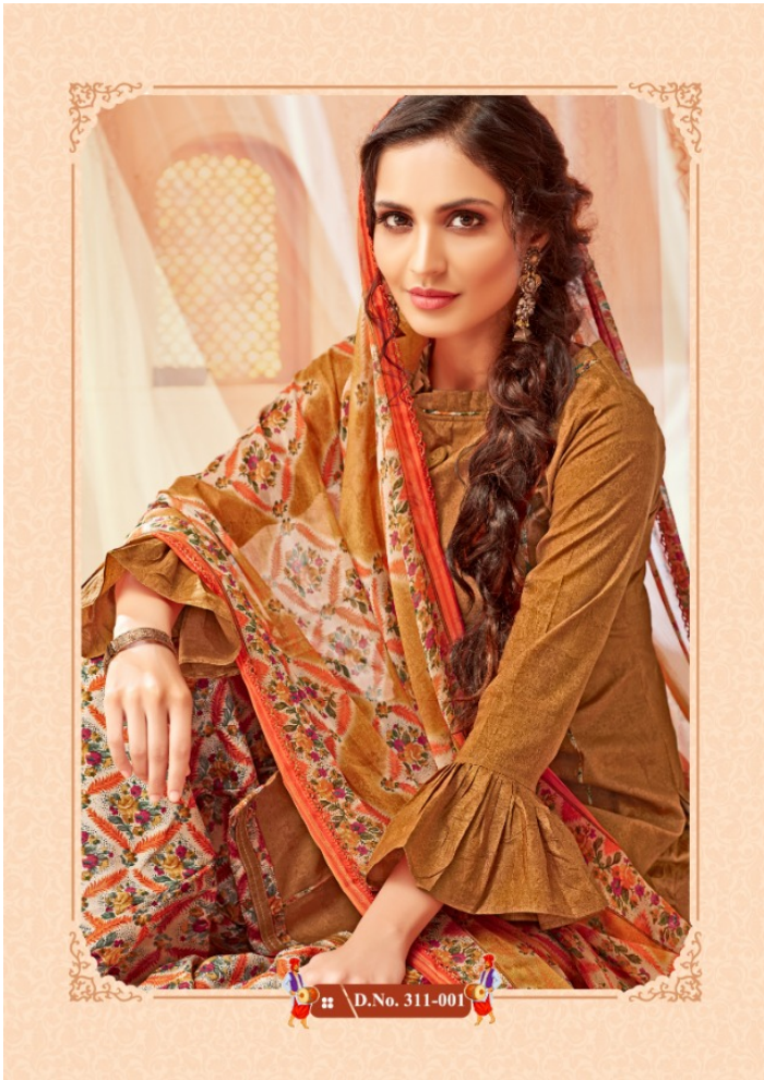
⌘ D.No. 311-001 ⌘