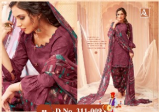
# D.No. 311-009