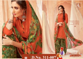
# D.No. 311-007