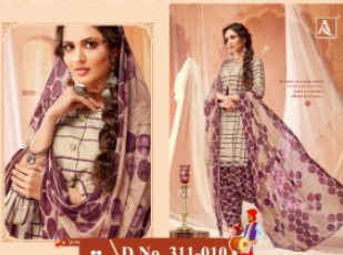
# D.No. 311-010