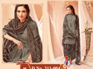
# D.No. 311-004