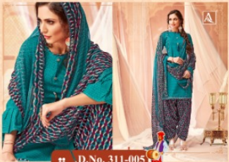
# D.No. 311-005