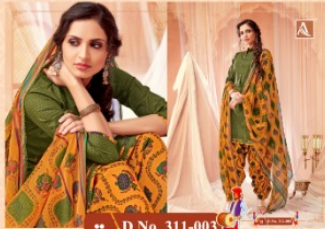
# D.No. 311-003