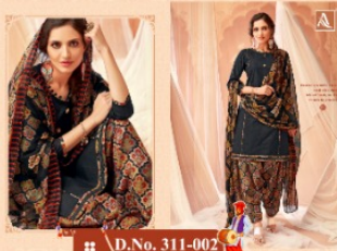
# D.No. 311-002