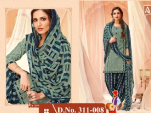
# D.No. 311-008