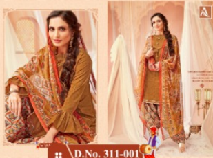
# D.No. 311-001