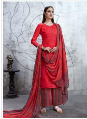
code no.114 - 006