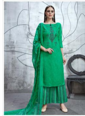
code no.114 - 007