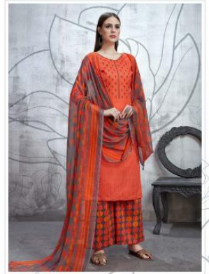
code no.114 - 008