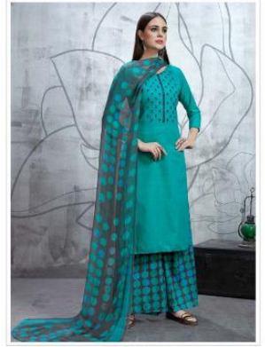
code no.114 - 004