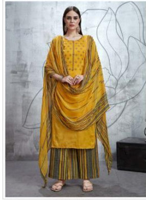
code no.114 - 002