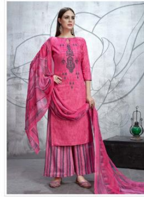
code no.114 - 003