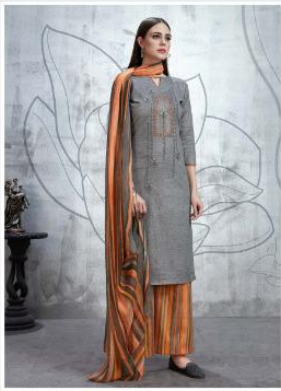
code no.114 - 005