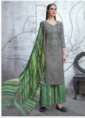
code no.114 - 001