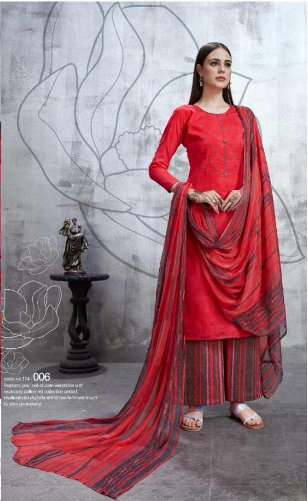
code no. 114 006 Replace your out-of-date wardrobe with exotically patterned collection and add multicolored dupatta enhances feminine touch to your personality.