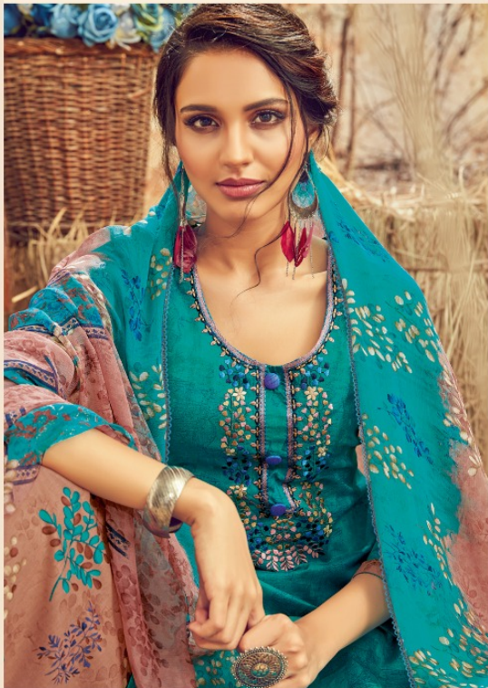
One's attire one wears speaks about her Personality. Indian woman is both traditional and modern. This collection is for her Be very Fashionable.