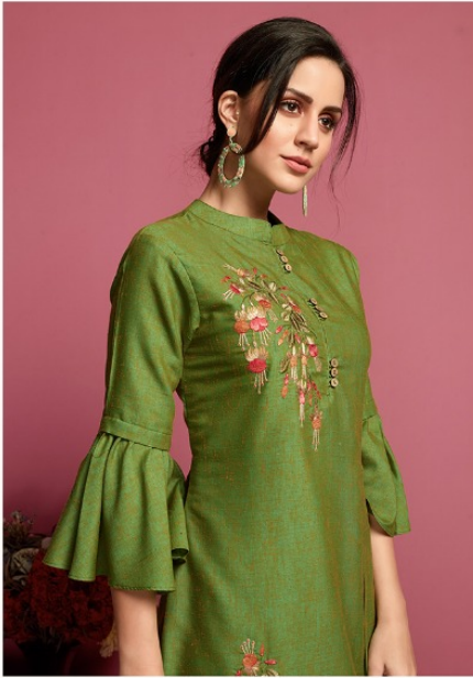
FASHIONABLE LIFE TC 516

You must dare to be different, cos styling is always to be exclusive. Differentiate yourself by jazzing up with our designs