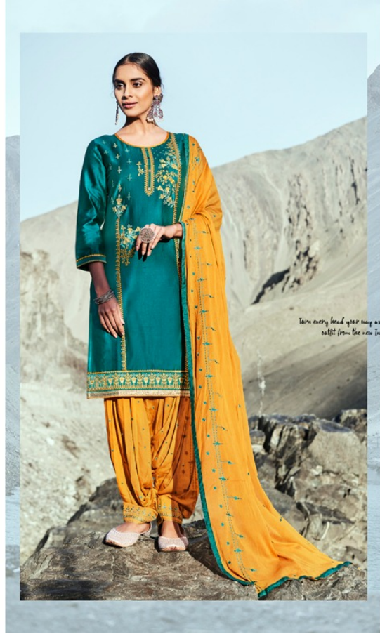
Turn every head your way as you stroll across in an outfit from the new Indian patiyala collection. D.NO.-1503