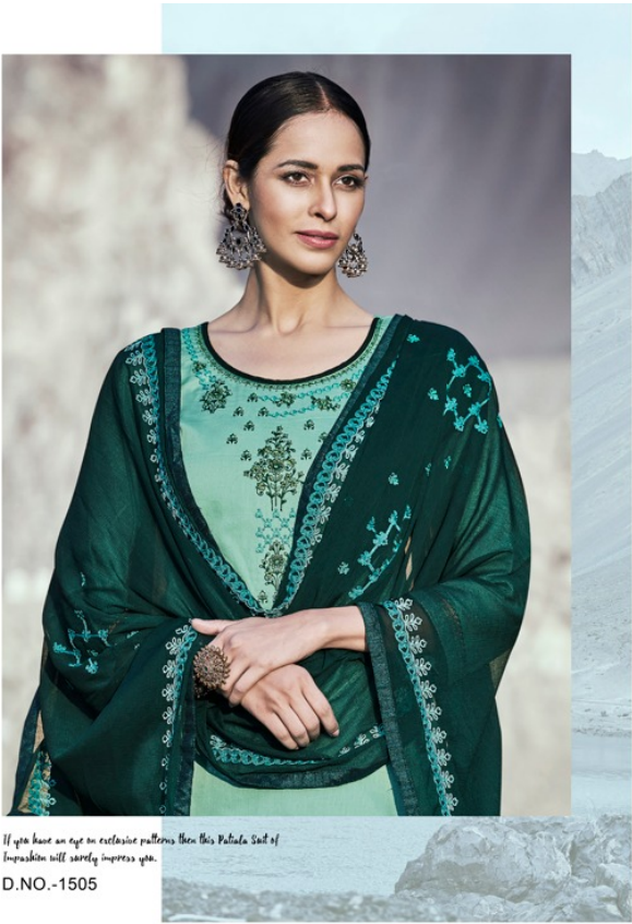
If you have an eye for exclusive patterns then this Palazzo Suit of Impression will surely impress you.