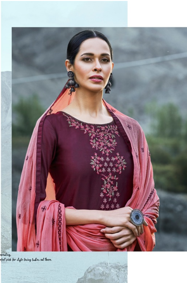
Vibrant and visually appealing, this pataka set is a perfect pick for style loving ladies out there.