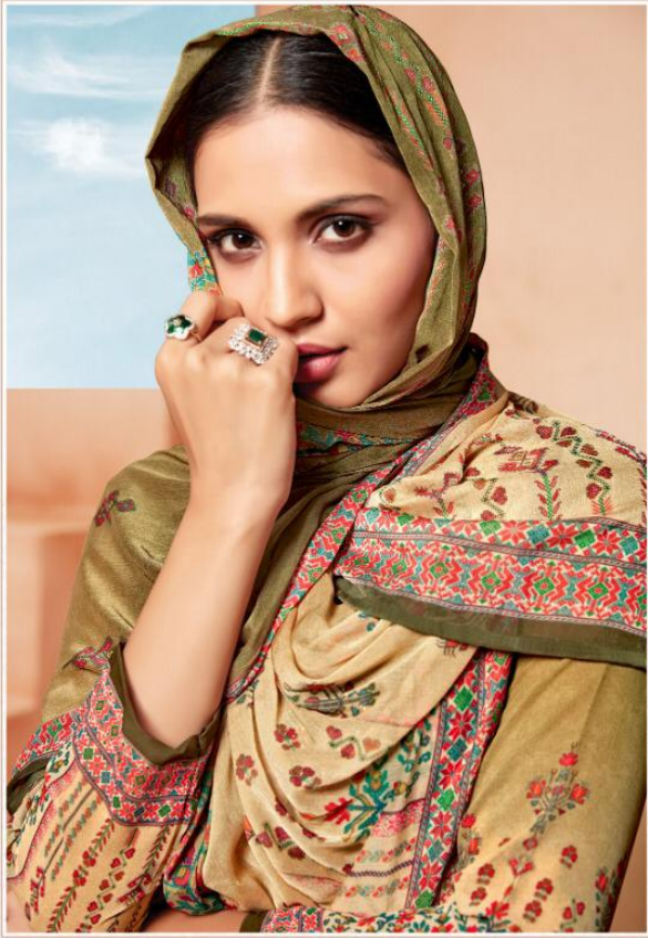
It is the caring that she lovingly gives the passion that she shows. The beauty of a woman grows with the passing years.