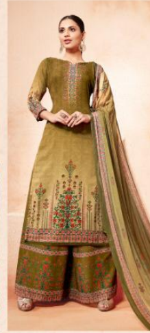
CODE # 11105