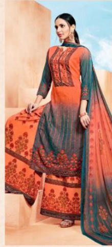
CODE # 11104