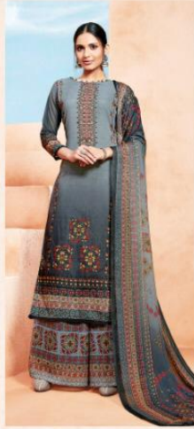
CODE # 11102