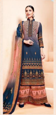
CODE # 11106