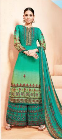
CODE # 11103