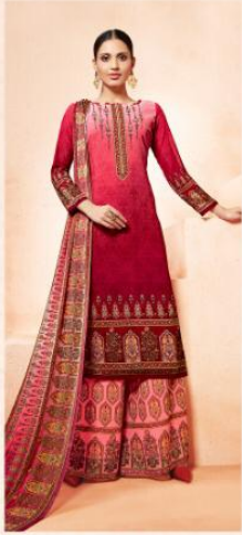
CODE # 11101