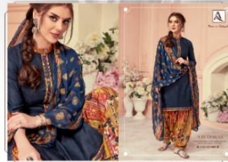
𑀓 D.No-321-009 𑀓