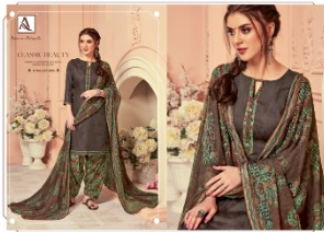
𑀓 D.No-321-005 𑀓