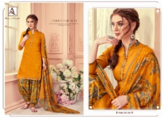
𑀓 D.No-321-002 𑀓