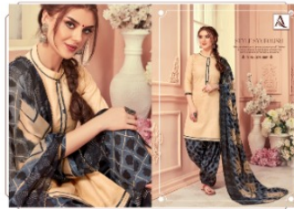
𑀓 D.No-321-006 𑀓