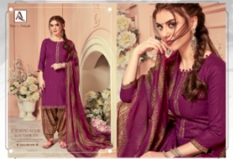
𑀓 D.No-321-010 𑀓