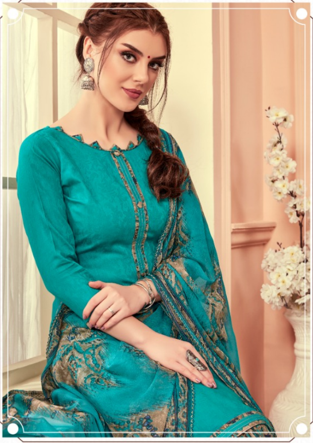
❖ D.No-321-003 ❖