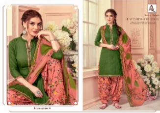
𑀓 D.No-321-004 𑀓