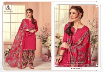
𑀓 D.No-321-008 𑀓