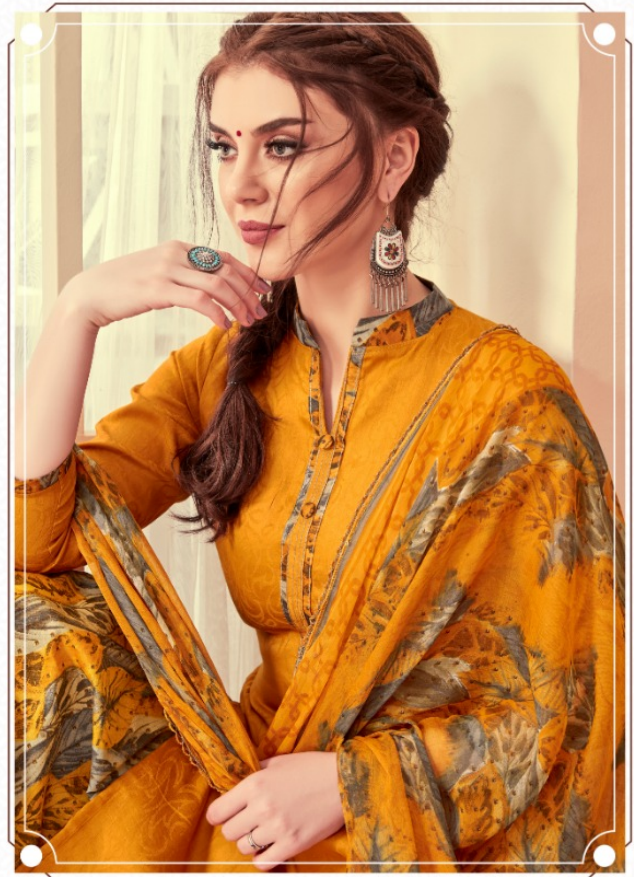
设计 D.No-321-002 黄