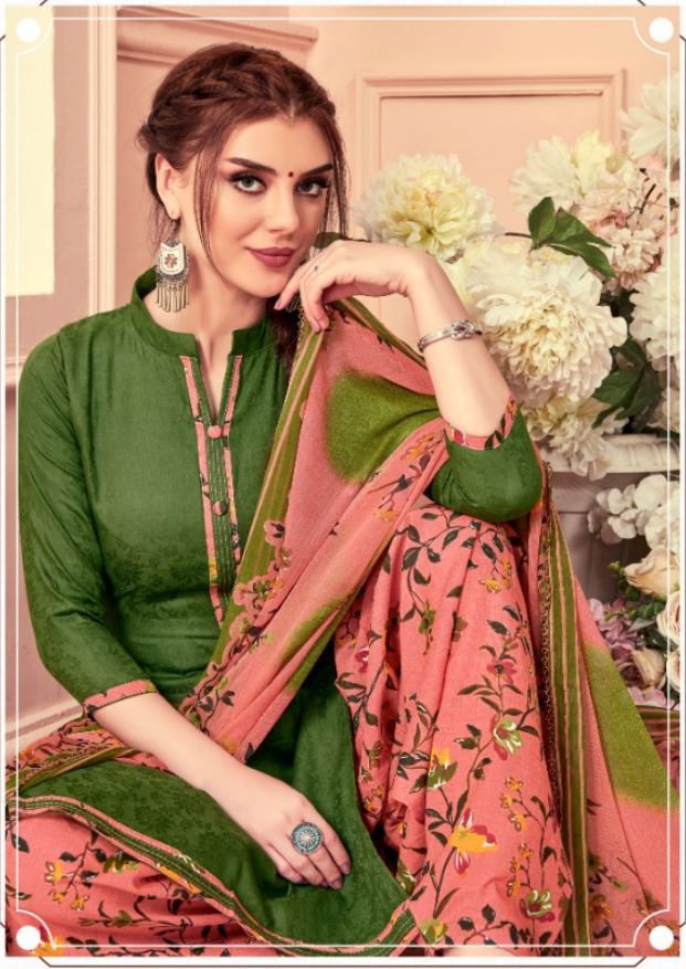
☆ D.No-321-004 ☆