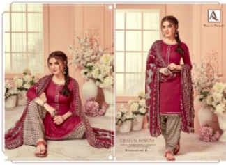
𑀓 D.No-321-001 𑀓