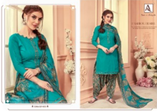
𑀓 D.No-321-003 𑀓