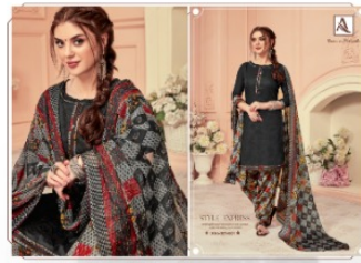
𑀓 D.No-321-007 𑀓