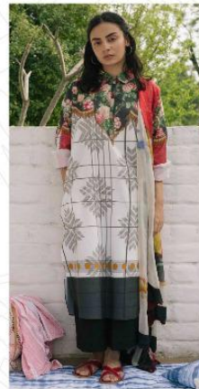
# 038 #