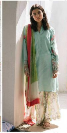
# 033 #