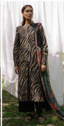
# 035 #