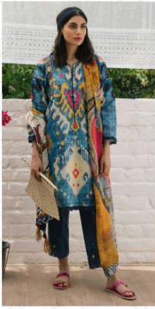
# 031 #