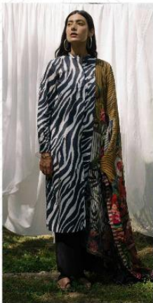
# 034 #