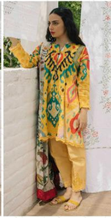
# 032 #