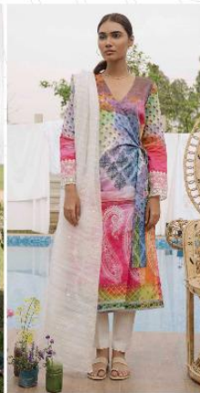
# 036 #