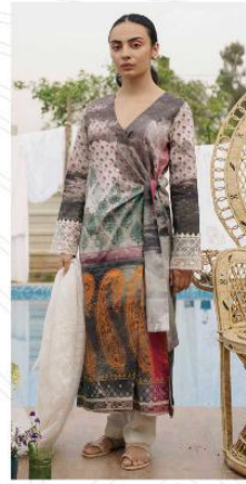
# 037 #