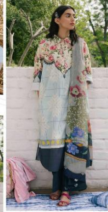
# 039 #